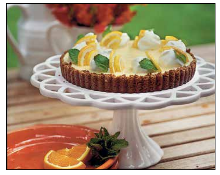
Prep time: 1 hr 20 mins Total time: 2 hrs 40 mins