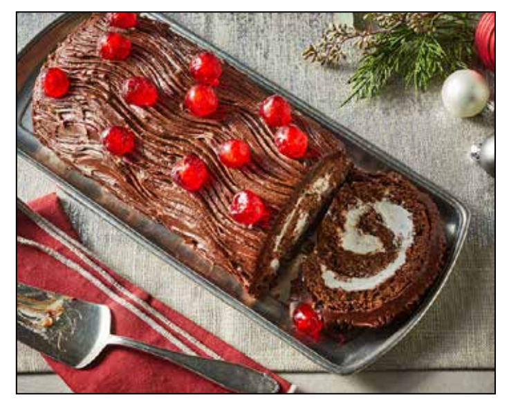
Prep time: 25 mins Total time: 1 hrs 35 mins