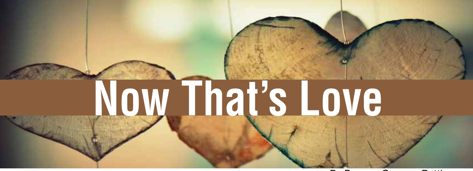
By Deacon Gregory Battle

1 Corinthians 16:13-14 - <sup>13</sup>Watch, stand fast in the faith, be brave, be strong. <sup>14</sup>Let all that you do be done with love.